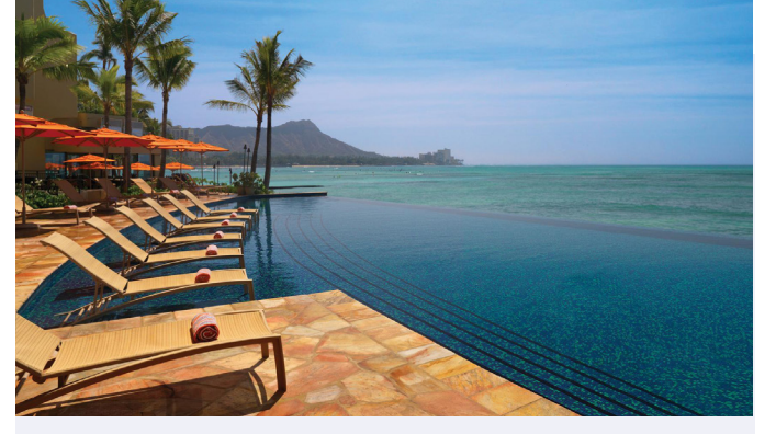
Soak up the warm, Hawaiian sun as you stay in 3 ocean-side resorts: the Sheraton Waikiki, Sheraton Kauai Coconut Beach Resort and Westin Maui.